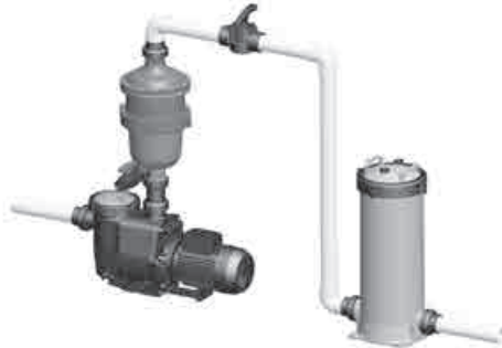
Installation with 2 way shut off valve

Whilst the pump is not operating close the 2 way shut off valve and open the purge valve. Switch on the pump to purge the sediment chamber of its sediment. Once the sediment chamber is purged, switch off the pump and open the 2 way shut off valve and close the purge valve.