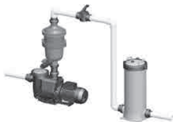
Typical installation with a cartridge filter