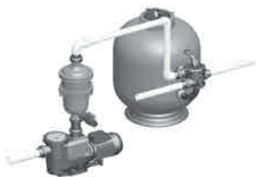
Typical installation with a sand filter

If the incoming water flow is less than the filter's minimum flow requirements, the filter's filtration efficiency will be affected, please consult Waterco.