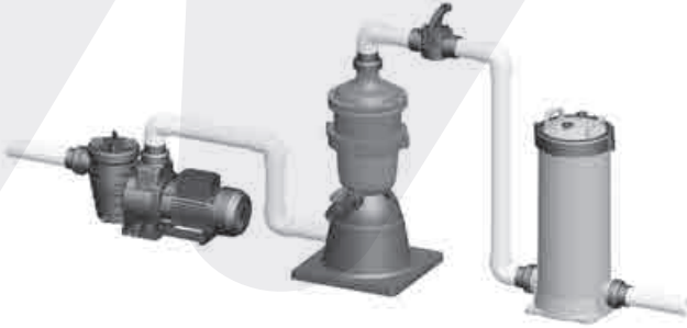
Installation with optional Mounting Stand

An optional Mounting Stand is also available for situations where the MultiCyclone cannot be installed directly above your pool pump.